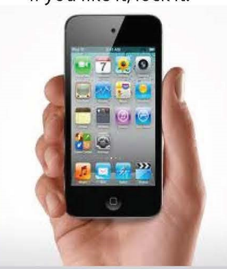
"If you like it, lock it!"

Unfortunately, our Lobo community is not immune to property theft. The message we promote is "if you like it, lock it". When using our athletic lockers, always lock your property. Our security staff will periodically check our PE locker-room area and secure any unsecured lockers with a district lock.